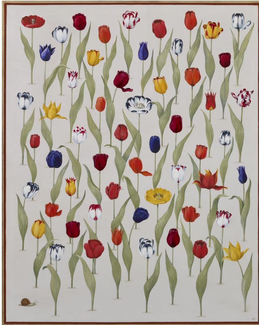
Dutch Gold , oil on linen, 30.25 x 24ins (77 x 61cm)

Not only is gardening an obsession, it has seeped into our soul – Rebecca Campbell