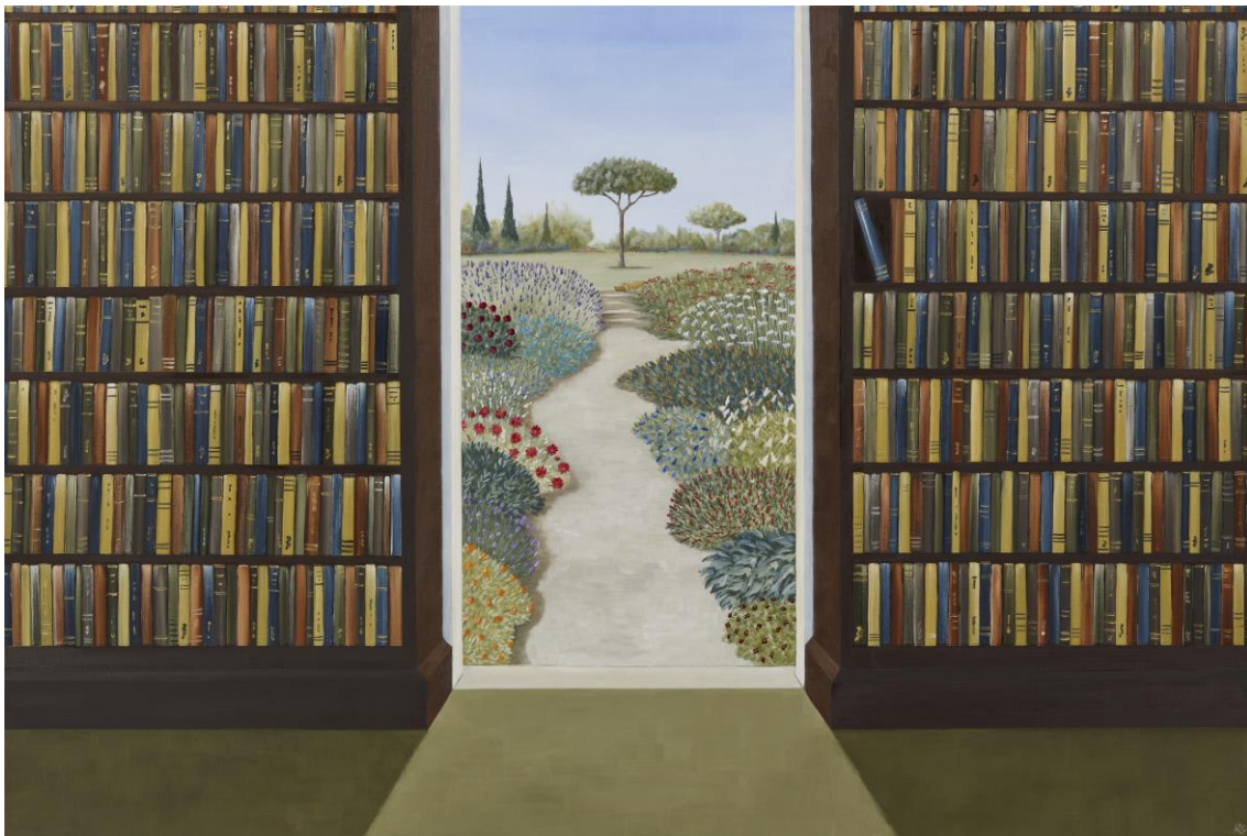
Life is Complete (If you have a garden and a library, you have everything you need – Cicero) oil on linen, 24 x 35.8ins (61 x 91cm)