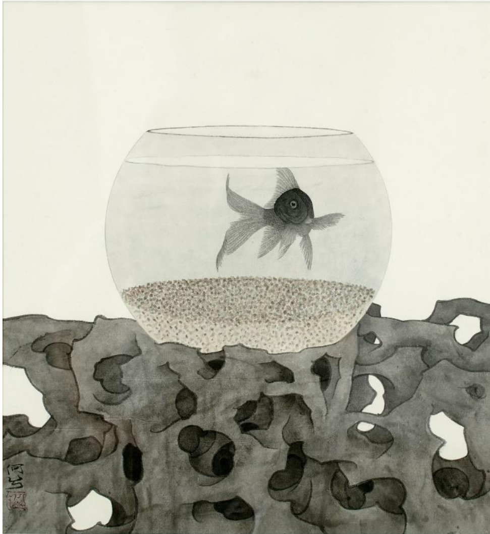
The Fish Being Watched II , ink & Chinese pigments on rice paper, 16.9 x 18.5ins (43 x 47cm)