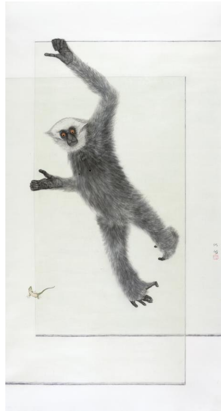
Urban Life No. 2 , ink & Chinese pigments on silk, 50.8 x 26.5ins (129 x 67.5cm)

Quietly humorous and often enigmatic, his thought-provoking paintings encourage the viewer to form their own interpretations of his idiosyncratic scenes. Frequently exploring the theme of freedom versus containment, in them we find a reflection of the human condition in the natural world, and an invitation to question the limits, both psychological and environmental, that we face in our journey through life.