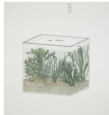
See the Sea III , ink and Chinese pigments on silk, 18 x 17.3ins (46 x 44cm) (left); Early Summer in the Bottle , 27.5 x 27.5ins (70 x 70cm) (centre) and As Long as You Live Better than Me , 17.75 x 17.75ins (45 x 45cm) (right), both ink & Chinese pigments on rice paper