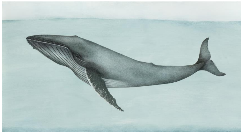
ABOVE: Humpback Whale , watercolour and acrylic on plaster, 21.7 x 39.4ins (55 x 100cm), by Harriet Bane

The paintings of Harriet Bane are characterised by a calm stillness, and a harmony of composition born from her early training in theatre design. Often focusing on a single animal, its environment suggested rather than fully delineated in the painting's background, her paintings are imbued with an iconic quality. Working on a gessoed ground, Bane first applies a layer of acrylic upon which she builds the multifarious colours and textures of fur or feathers in watercolour. Usually intimate in scale, many of her paintings depict the small birds that she observes in the Guernsey landscape, while several in this exhibition represent a new departure for the artist as she works to a larger, more monumental size.