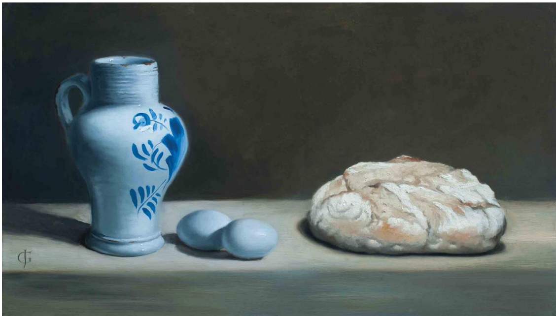
ABOVE: 18th-Century Delft Vase, Blue Eggs & Bread , oils on linen over panel, 11.5 x 20ins (29.2 x 50.8cm)

In June 2019 contemporary artist James Gillick will be returning to Jonathan Cooper, Chelsea, with an exhibition of 19 new still life paintings.