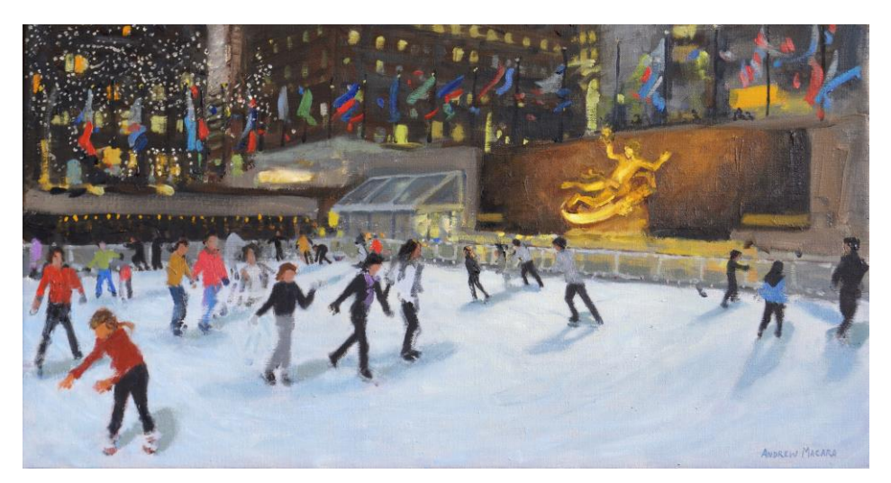
Evening, Rockefeller Ice Rink, New York, oil on linen, 16 x 30ins (40.6 x 76.2cm)

Jonathan Cooper - founded in 1988 - is a London based contemporary art gallery specialising in representational drawing, painting, photography and sculpture. The gallery is a member of SLAD (The Society of London Art Dealers), BADA (The British Antique Dealers Association) and LAPADA (The Association of Art & Antique Dealers), and regularly exhibits at international art fairs.