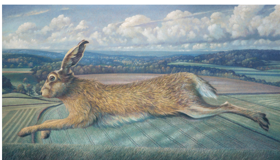
James Lynch The longleat Hare Egg tempera on gesso coated wood panel 74 x 130cm