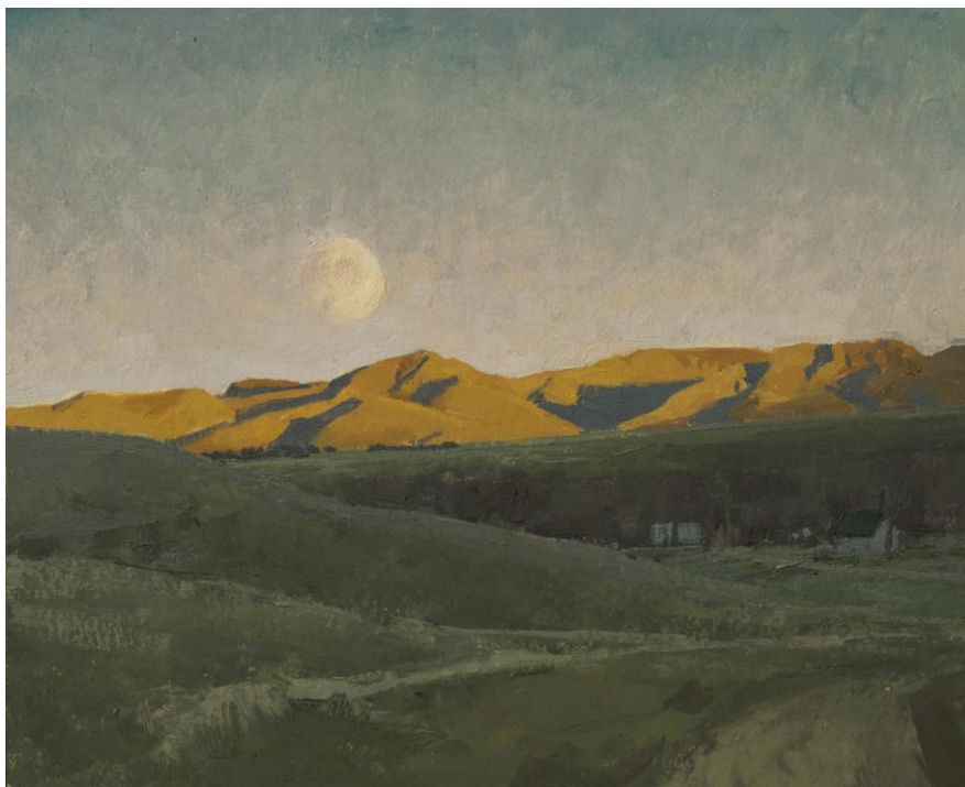
ABOVE: The Pale Suitor , oil on paper board, 7.75 x 9.25ins (19.7 x 23.5cm)

The acclaimed American artist's first solo exhibition in the UK