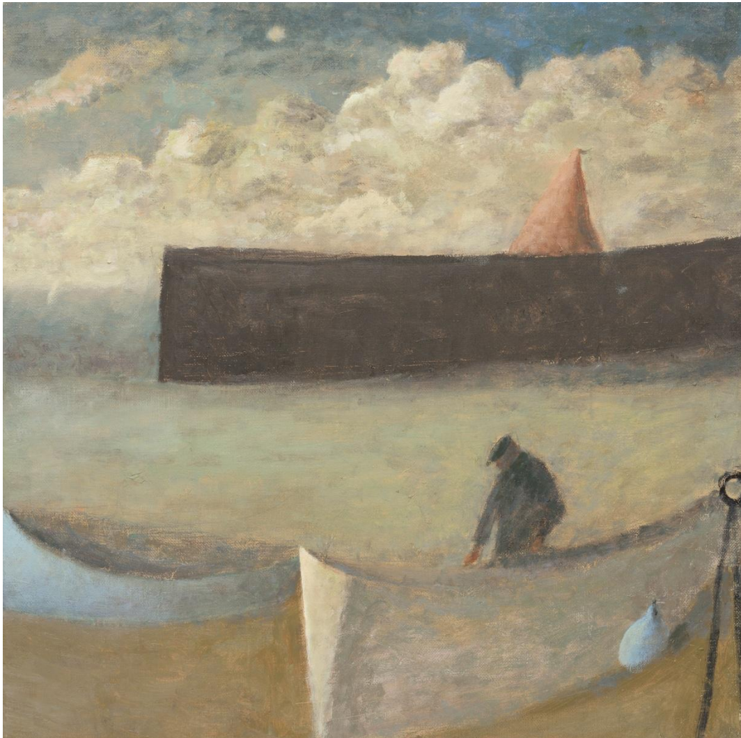
ABOVE: Fisherman and Sail , oil on linen, 15.75 x 15.75ins (40 x 40cm), by Nicholas Turner

Nicholas Turner | To and Fro | 4 – 27 May 2017