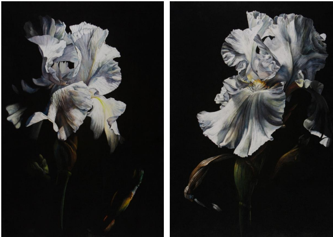
ABOVE: Chiaroscuro I and Chiaroscuro II , both charcoal and watercolour on white Arches 640gsm rough paper, 58 x 40ins (147 x 102cm)

An exhibition of dramatic new paintings in watercolour and charcoal by one of the world's leading botanical artists